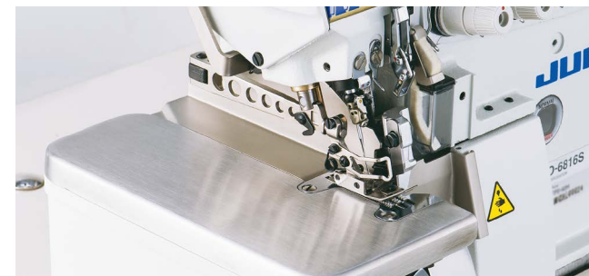
For runstitch / MO-6816S-FF6-30H