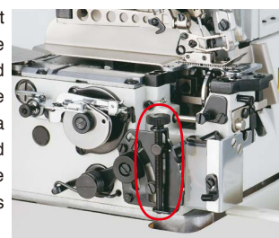
Differential-feed micro-adjustment mechanism

The differential-feed micro-adjustment mechanism, external increasing of the differential feed ratio and the main feed dog height can all be adjustable on the front face of the sewing machine with a screwdriver. The machine is provided as standard with functions which enable easy and best-suited adjustments according to the material to be used.