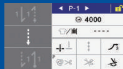
Detailed home screen

There are three types of operator panel display. All the detailed home screen, quick home screen and easy home screen are easy to use without concern for panel operation.