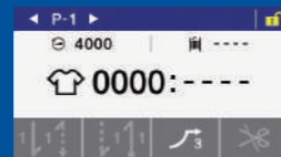
Easy home screen