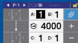
Quick home screen